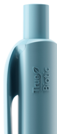
DS8 True Biotic

https://www.prodir.com/en/pens/true-biotic-pens